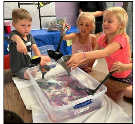
The children filter (clean) the water in this sensory table.