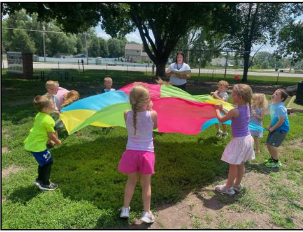
The parachute represents a storm which blows fiercely and then is calmed.