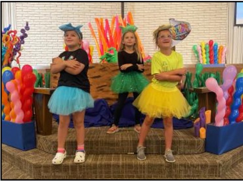
Three little fishes lead the dances.