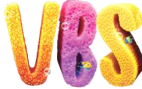
Keep your boats afloat — and remember that God won't let us sink.